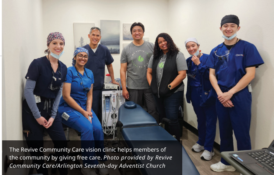
The Revive Community Care vision clinic helps members of the community by giving free care.