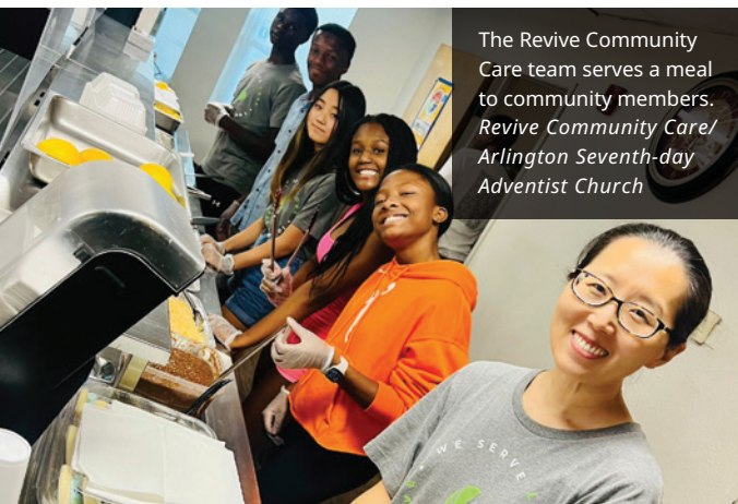
The Revive Community Care team serves a meal to community members.