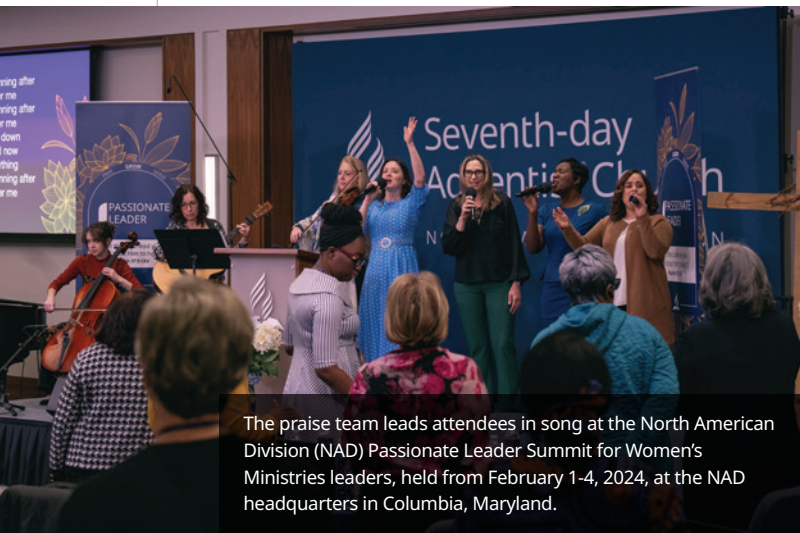
The praise team leads attendees in song at the North American Division (NAD) Passionate Leader Summit for Women's Ministries leaders, held from February 1-4, 2024, at the NAD headquarters in Columbia, Maryland.

She stated, "If you collaborate with Him, it's bound to be OK. It might not be perfect. But knowing that I'm working with the Perfect One, . . . that's extremely encouraging and takes a lot of pressure off."