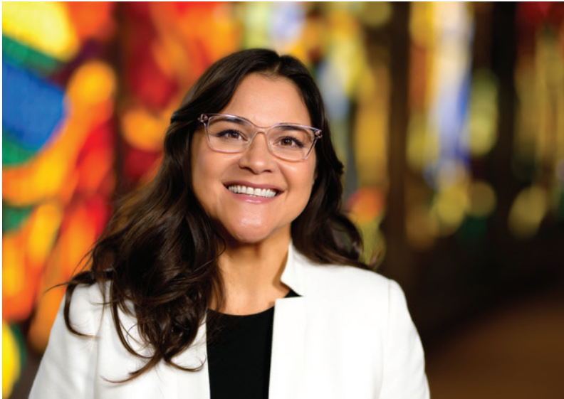
← Yami Bazan has been named the next president for Union College, starting in the summer of 2024.