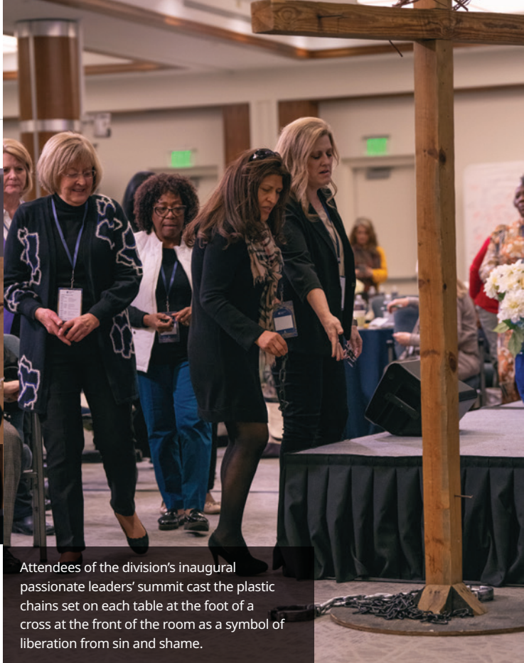
Attendees of the division's inaugural passionate leaders' summit cast the plastic chains set on each table at the foot of a cross at the front of the room as a symbol of liberation from sin and shame.