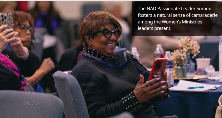
The NAD Passionate Leader Summit fosters a natural sense of camaraderie among the Women's Ministries leaders present.

Coming soon: passionate leader training modules will be available on the Adventist Learning Community at adventistlearningcommunity.com . For info on these and other Women's Ministries offerings, visit nadwm.org .