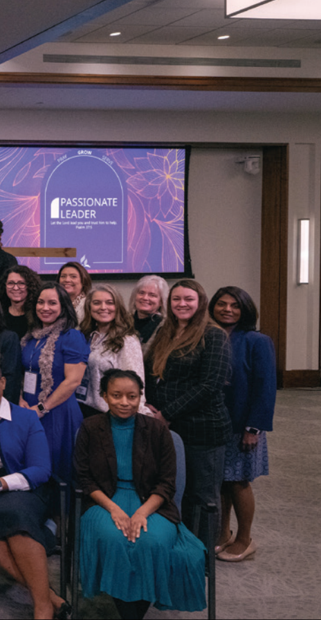
Attendees of the North American Division Passionate Leader Summit gather for a group photo.