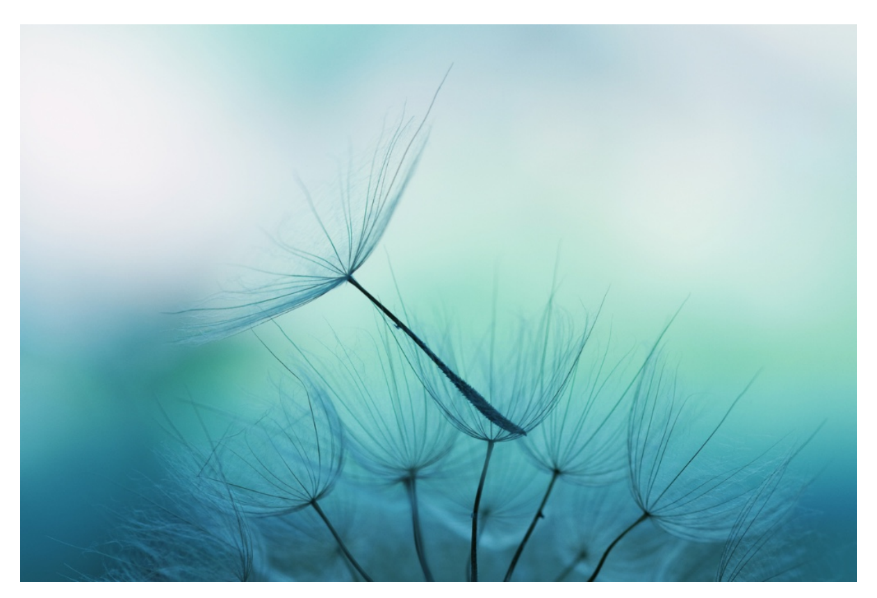
Still Small Voice

"There's something uniquely beautiful about God's still small voice when you are at your most difficult trials. When you are at that place where it doesn't seem like anybody can help you, nobody can be with you, you are alone ... it's at that time that the powerful, powerful still small voice comes to you. And God reminds us, 'Yes, I am bigger than you. I am bigger than your surgery. I am bigger than your finances; ... and because I am big, I can protect you. I care for you. I know you're frail and weak, but I love you.' There's nothing more powerful than to hear that from God."