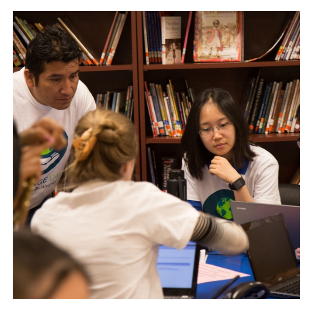
On Sept. 13, Andrews University held its second annual Change

has pledged financial support; and businesses and the American Red Cross have donated hygiene kits, water, and non-perishables. READ MORE