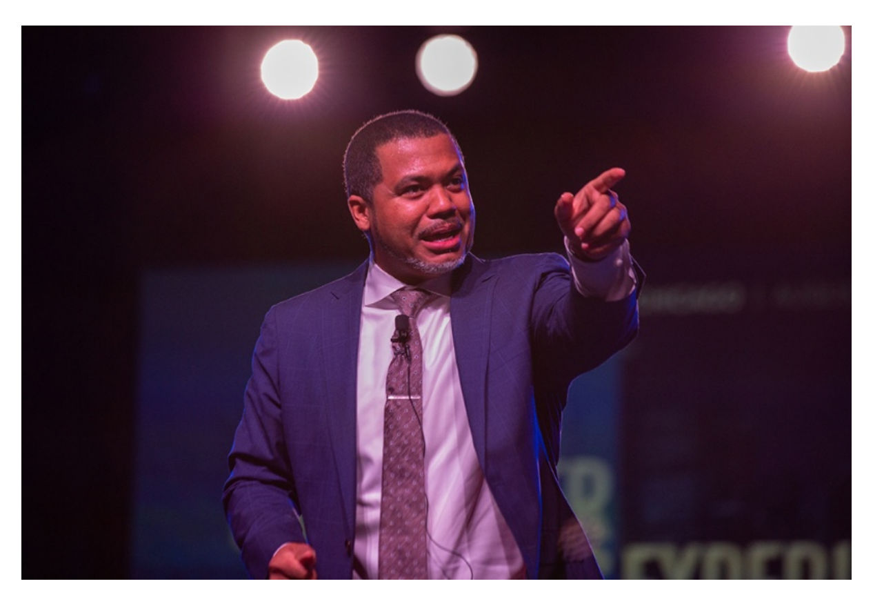
A Student of Students

"Become a student of your students. Study them like a missionary studies culture, language, heroes, symbols, rituals — humble yourself. And recognize that you are not normal. You were born in a very particular place in the world. In a continent, in a nation, in a state, in a city, in a neighborhood. You and I were born in a very particular point in history. You and I learned very particular patterns of thinking, of feeling, and patterns of behaving (culture); we learned these patterns from a very particular group of people so everything [we] do is culturally conditioned. ... Just because you're normal among the group of people that shaped you, don't make the mistake of believing that you are also the norm by which everybody else should be evaluated. Your normal is not everybody else's normal."